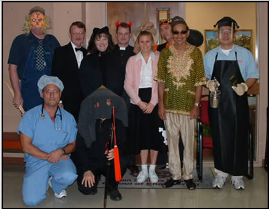
The School of Engineering - Halloween 2003

CBU Home | Engineering Home | Chemical | Civil | Electrical | Mechanical | Management