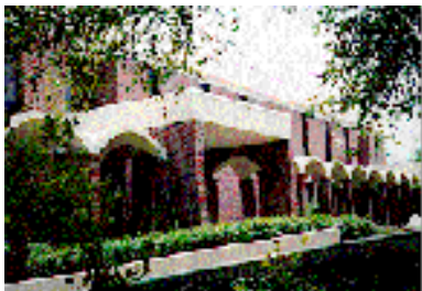
Nolan Engrg Center, CBU